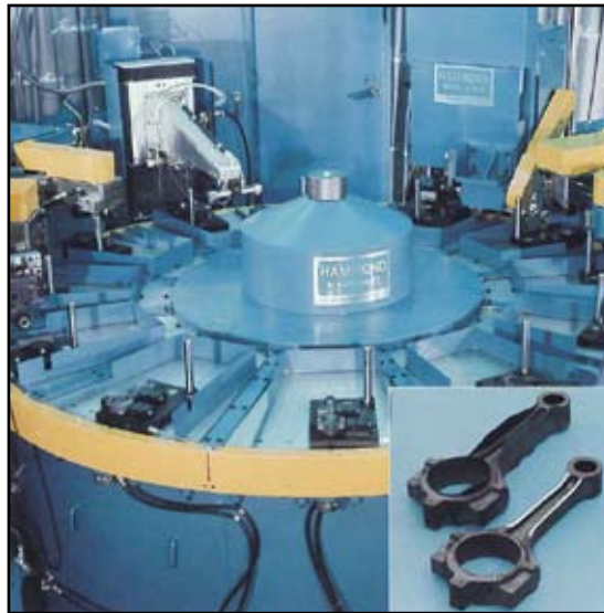
Hammond's twelve station rotary index machine automatically deflashes and shank mills 450 connecting rods per hour.

In the past Hammond used the heat treat method but since 1993 have switched to the Meta-Lax stress relief and weld conditioning method.